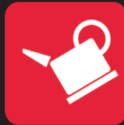
RESISTANT TO OILS AND CHEMICALS