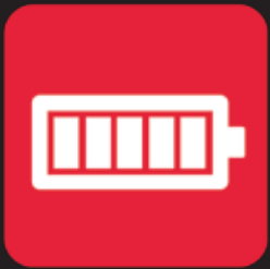
EXTRA-LONG BATTERY LIFE