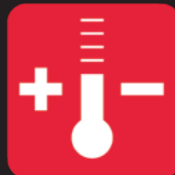
RESISTANT TO EXTREME TEMPERATURES