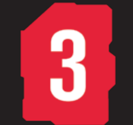
3-YEAR COMPREHENSIVE WARRANTY