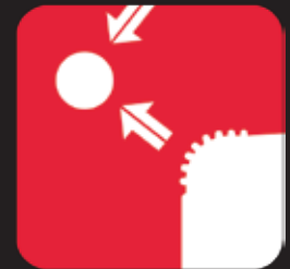
PROTECTION FROM DROPS