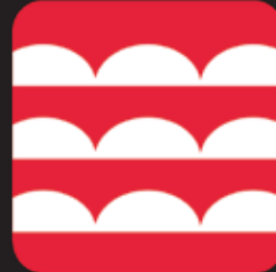
PROTECTION FROM MICROPARTICLES