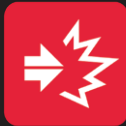
RESISTANT TO PUNCTURES