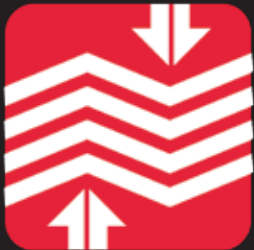
RESISTANT TO SHOCKS & VIBRATIONS